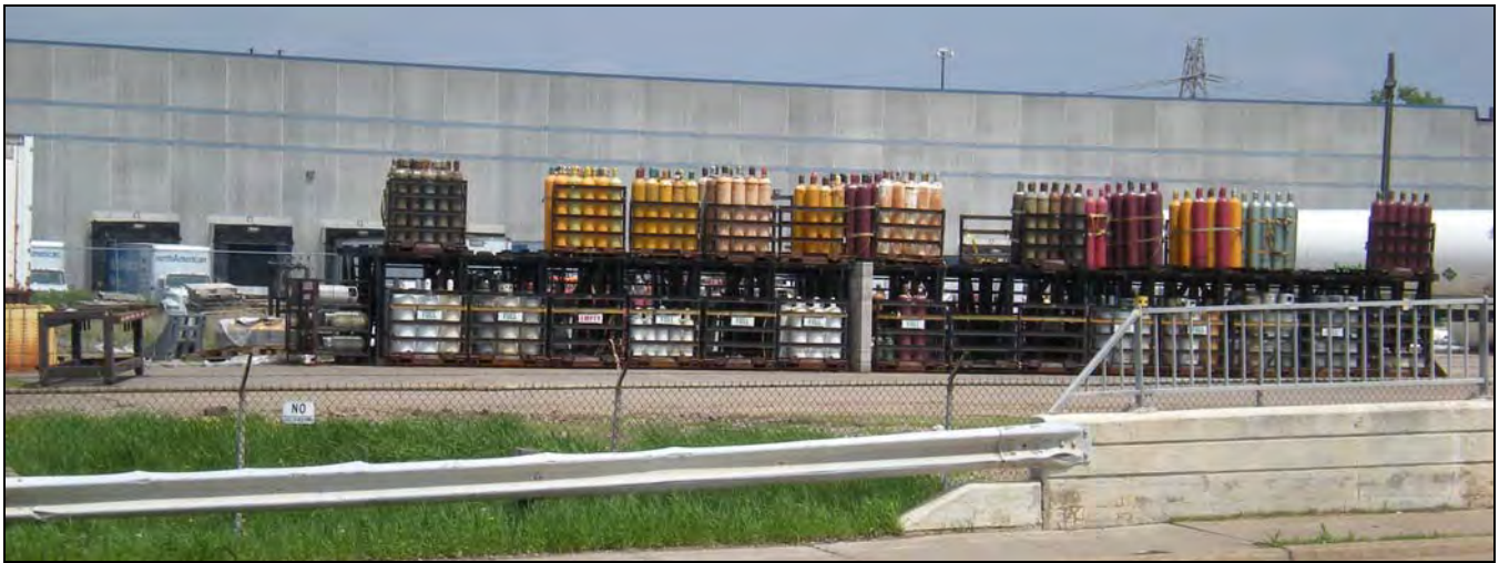
Equipment/goods, well screened