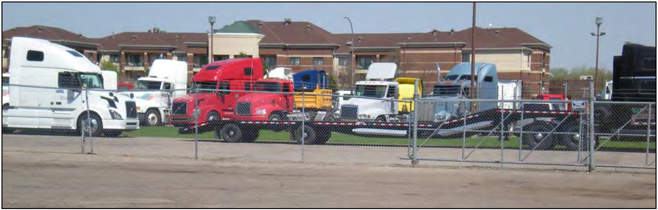
Active fleet vehicles