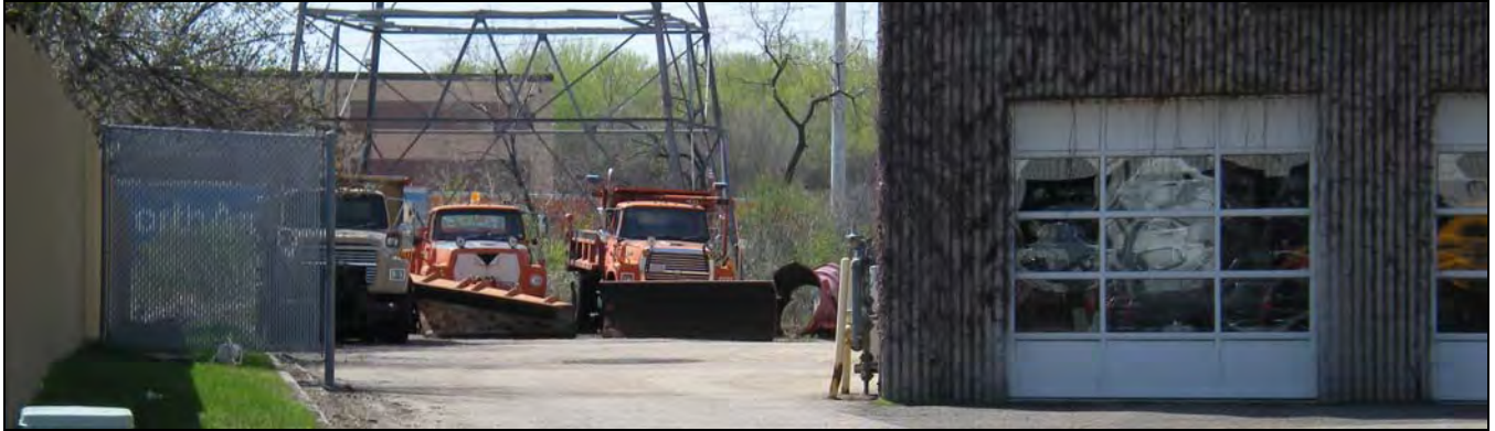
Equipment/goods, poorly screened