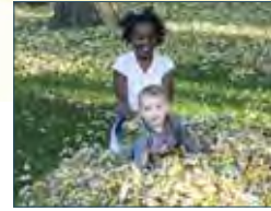
Page 7 Leaves Will Soon be Falling