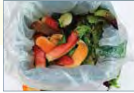
Page 6 Organics Recycling