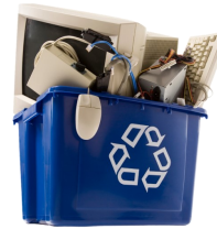
Free E-Waste Recycling