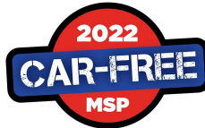
Car-Free Day 2022