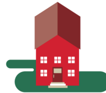
Home Energy Squad Giveaway!