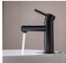
Sustainability Tip of the Month—Water Conservation